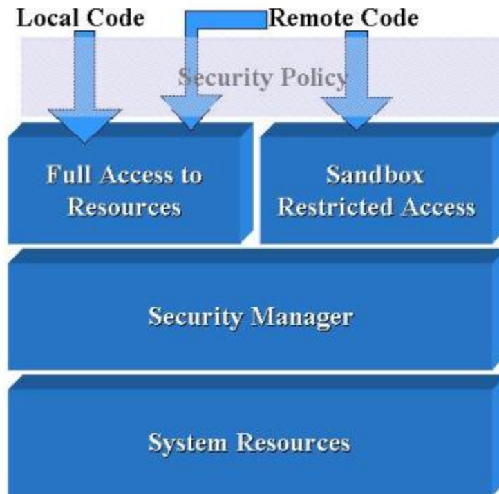
Figure 1 - Java Model